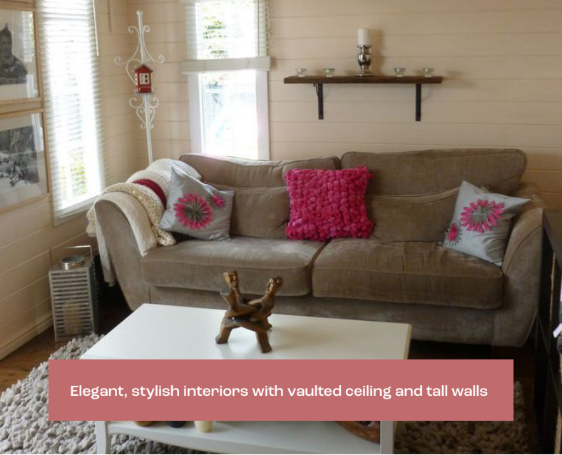
Elegant, stylish interiors with vaulted ceiling and tall walls