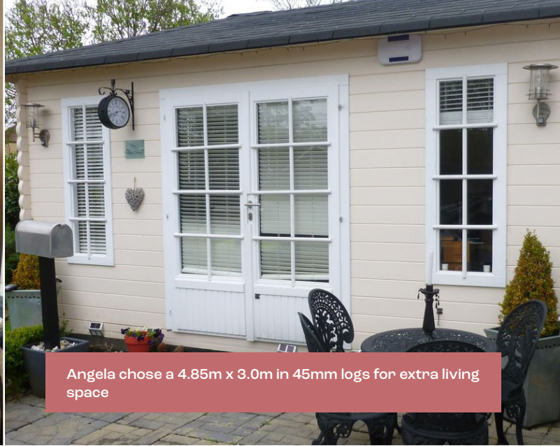
Angela chose a 4.85m x 3.0m in 45mm logs for extra living space