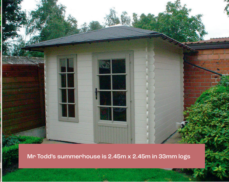
Mr Todd's summerhouse is 2.45m x 2.45m in 33mm logs