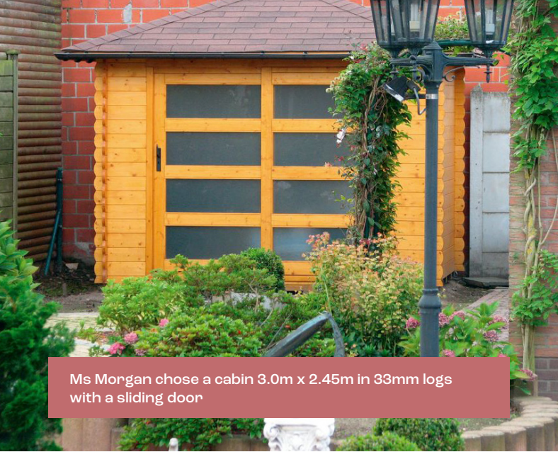
Ms Morgan chose a cabin 3.0m x 2.45m in 33mm logs with a sliding door