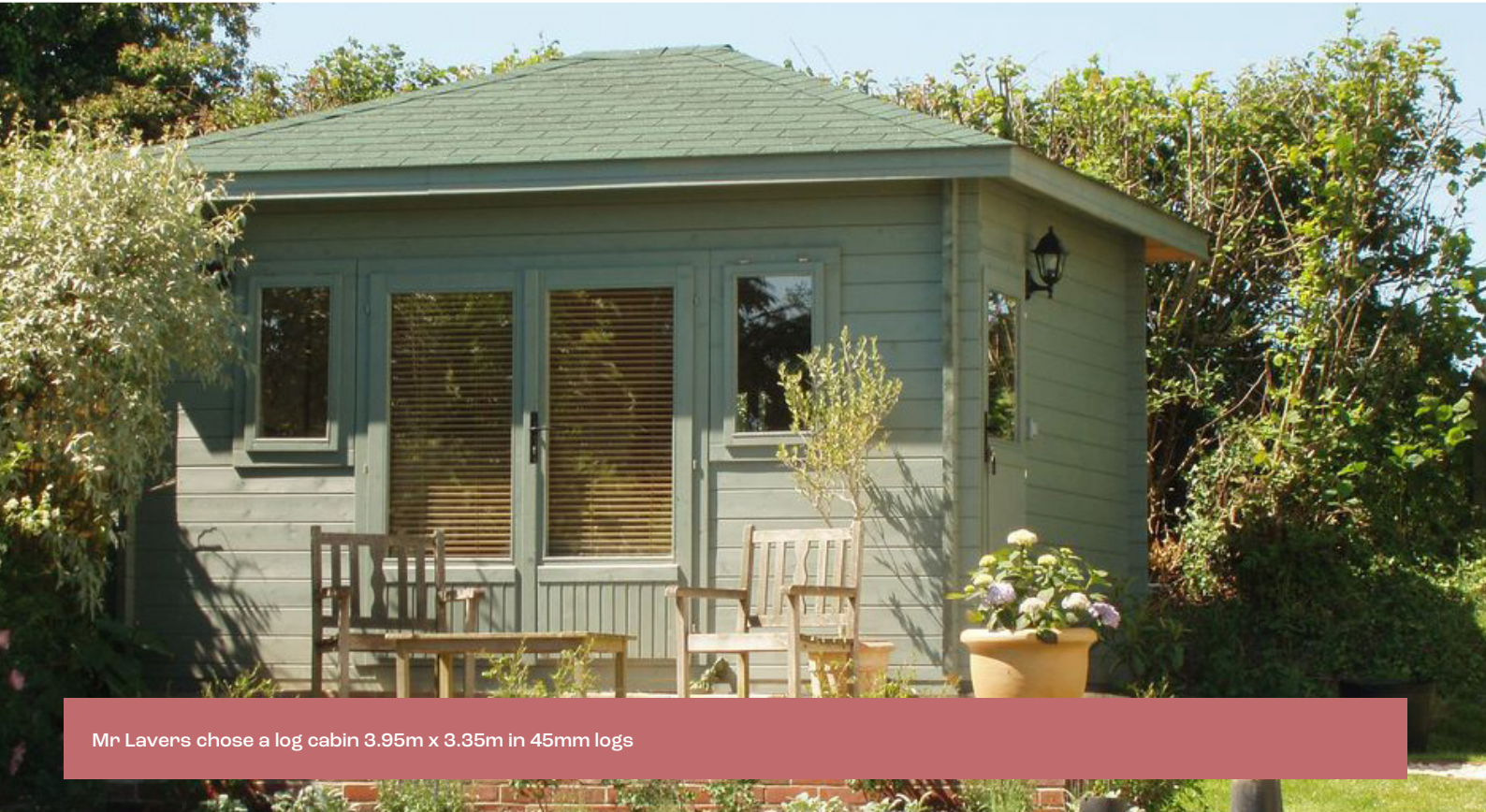
Mr Lavers chose a log cabin 3.95m x 3.35m in 45mm logs