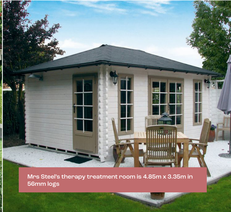
Mrs Steel's therapy treatment room is 4.85m x 3.35m in 56mm logs