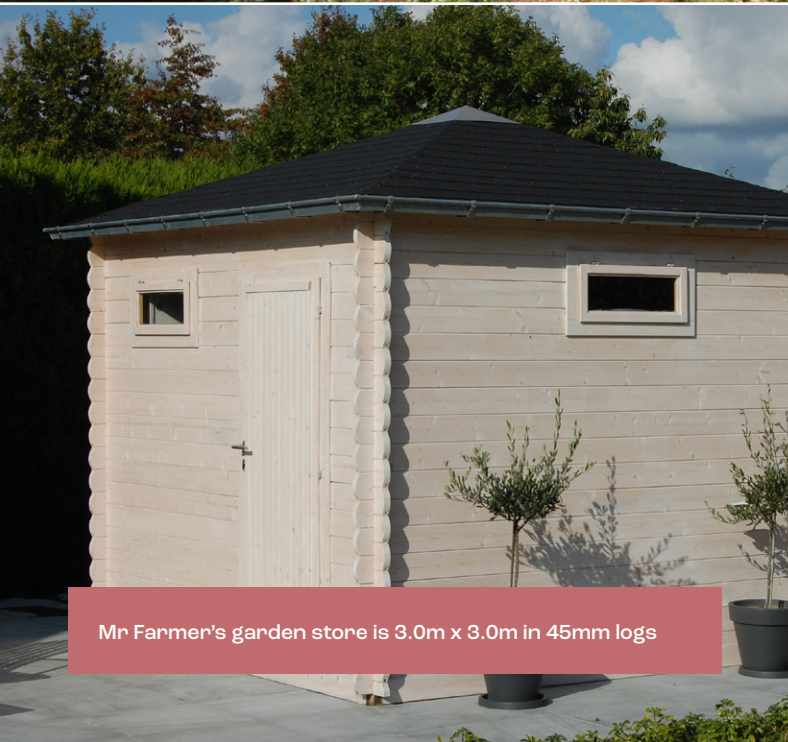
Mr Farmer's garden store is 3.0m x 3.0m in 45mm logs