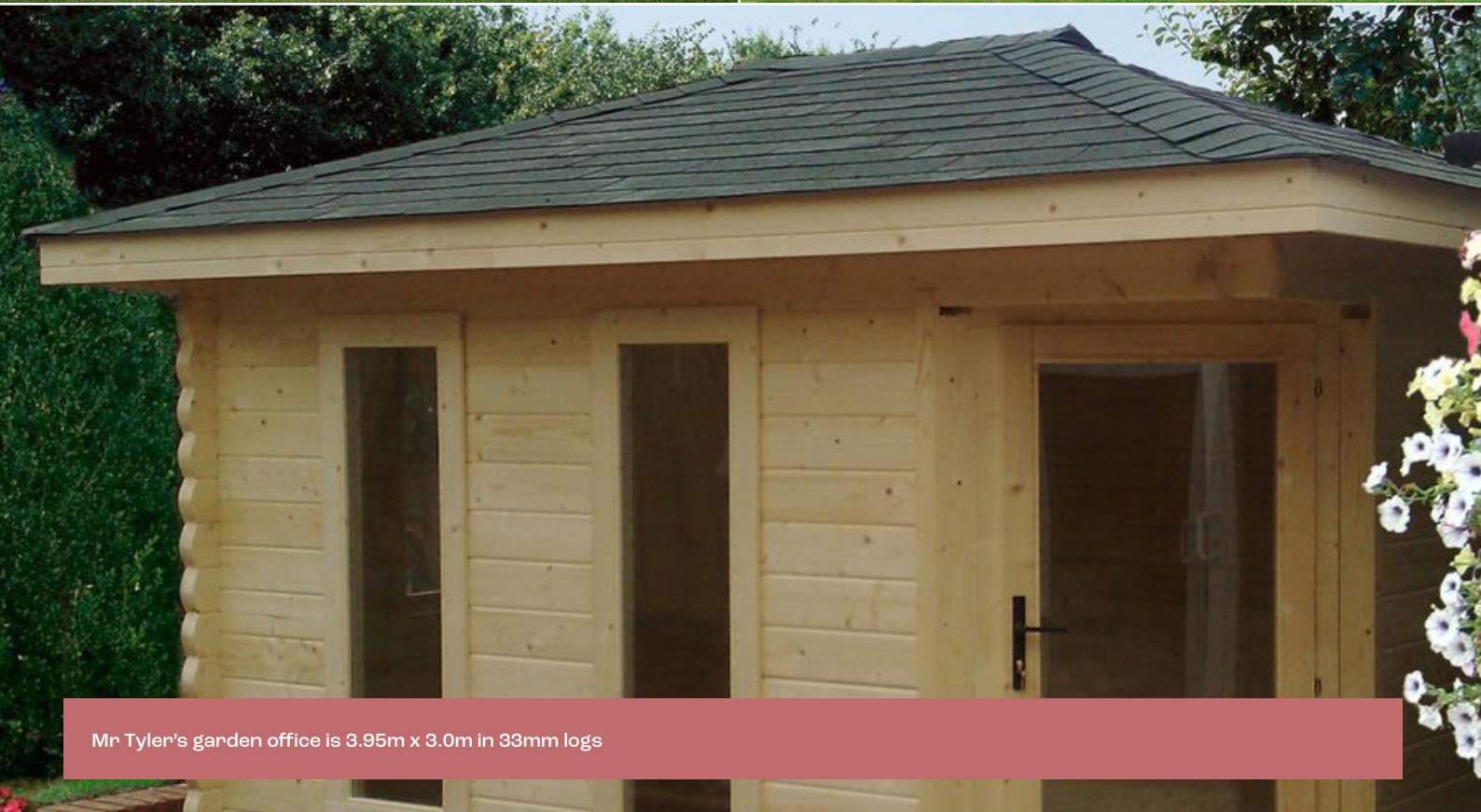
Mr Tyler's garden office is 3.95m x 3.0m in 33mm logs