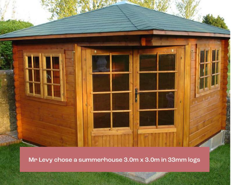
Mr Levy chose a summerhouse 3.0m x 3.0m in 33mm logs