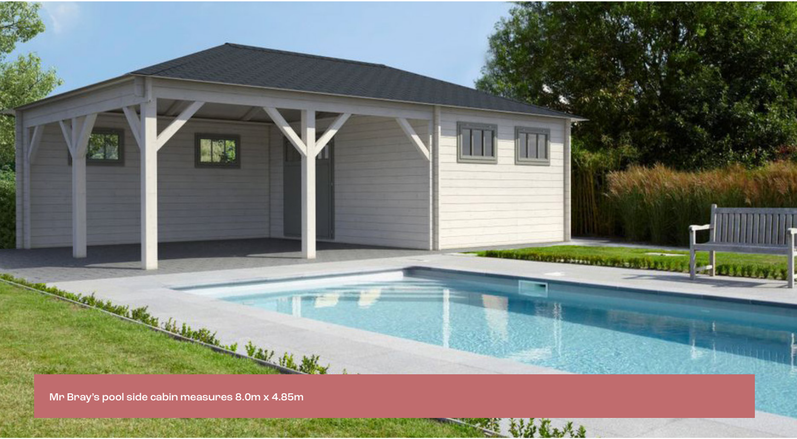
Mr Bray's pool side cabin measures 8.0m x 4.85m