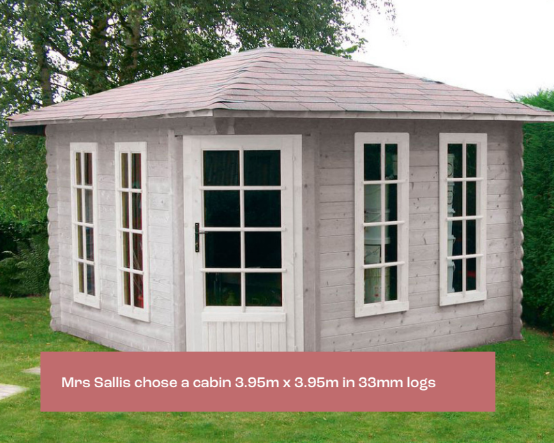
Mrs Sallis chose a cabin 3.95m x 3.95m in 33mm logs