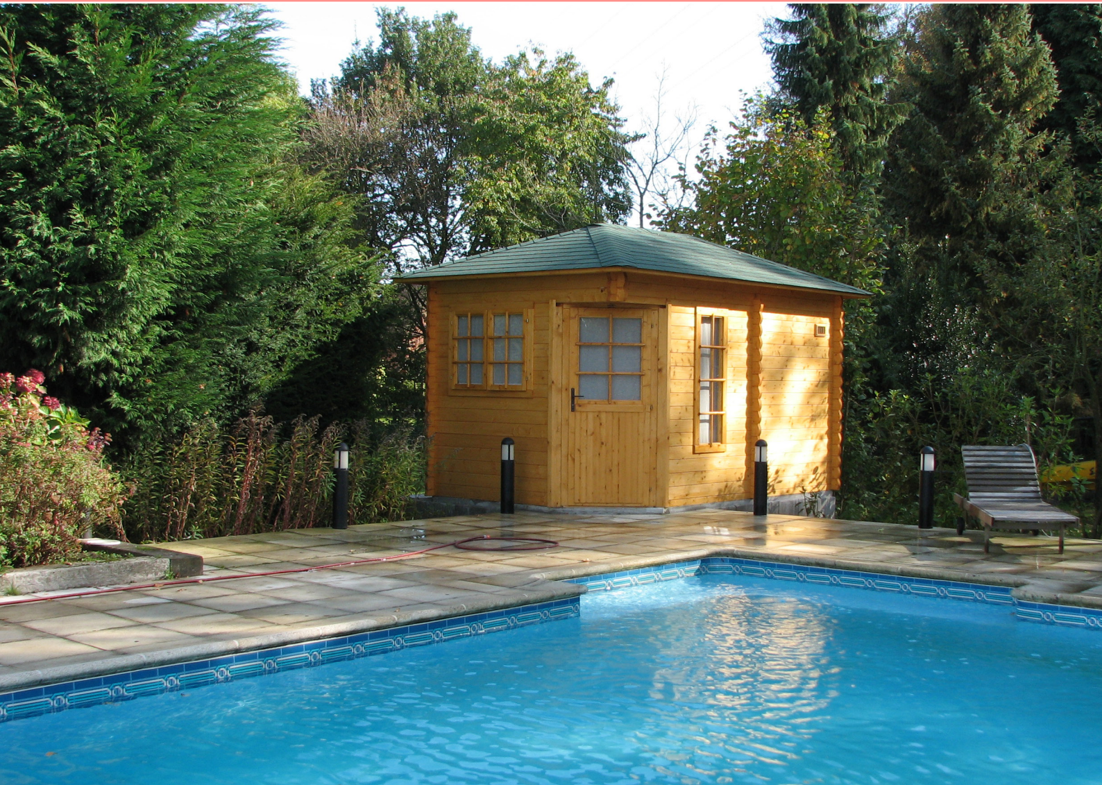
Mrs Glover's pool side cabin is 3.95m x 2.45m in 45mm logs

For those seeking the ultimate traditional look, consider upgrading to Western Red Cedar shingles, adding a touch of timeless elegance to your cabin. Create a distinctive and inviting space in the corner of your garden with these customisable options.