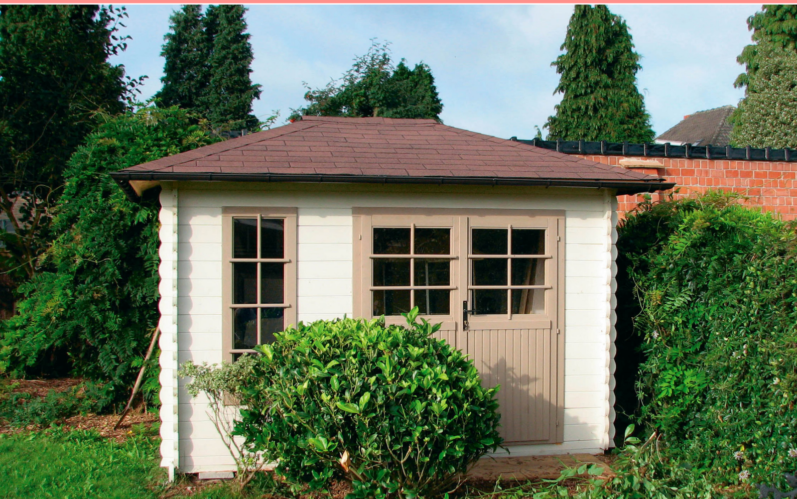
Mr Stanley chose a workshop 3.35m x 3.0m in 33mm logs

Now available in any size up to 6m by 10m, these cabins provide the flexibility to partition into separate rooms, accommodating a variety of needs. Experience the allure of the traditional English summerhouse with our hipped roof cabins, where style meets versatility.