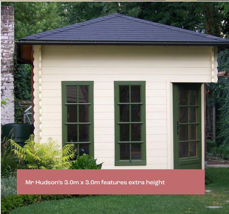
Mr Hudson's 3.0m x 3.0m features extra height