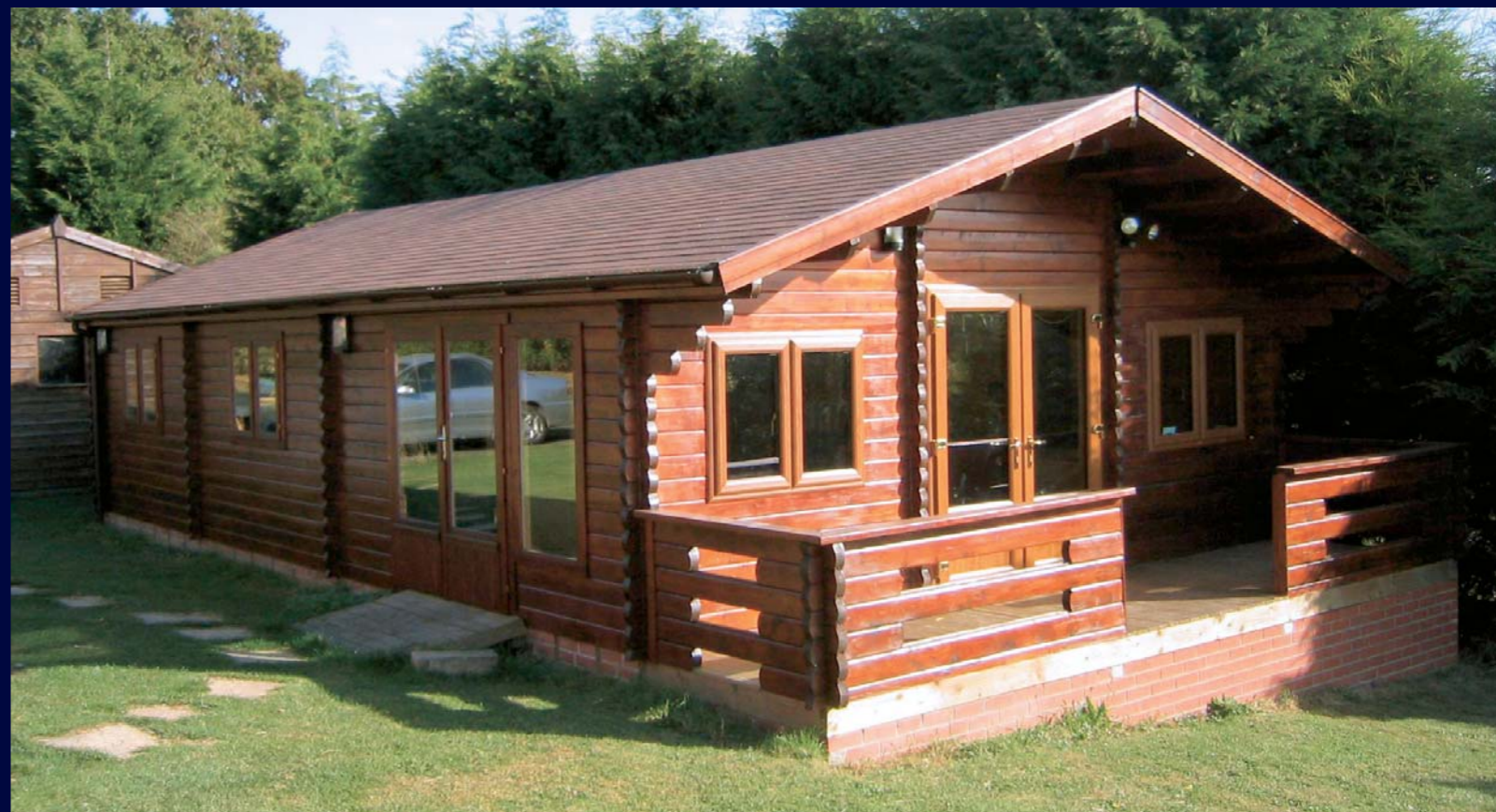
The Two Bedroom Lodge with optional double side door and long window panel