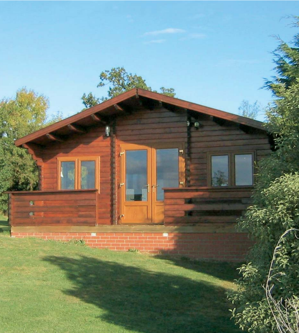
The lodge shown with optional UPVC golden oak double glazing