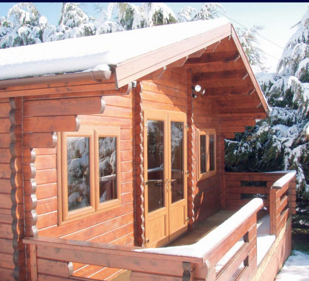
2 Featuring a 1m canopy and optional 1.5m veranda