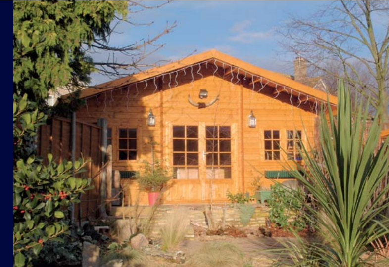
Mr Simpsons 6.0m x 10.0m lodge in 56mm logs