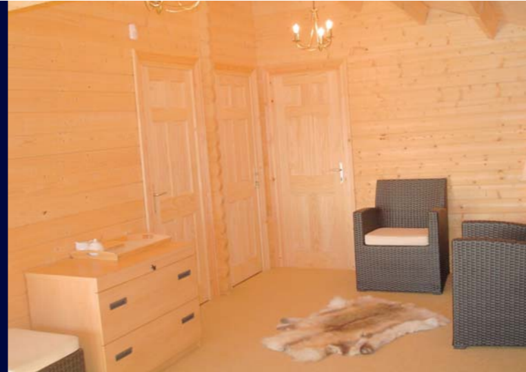
Light and airy interior

The 6 metre wide Interlock Two Bedroom Lodge provides two 3m x 3m bedrooms, a 3m x 2m bathroom, a 3m x 4m kitchen diner and a fantastic 6m x 4m lounge. Although ideal for holiday or guest accommodation, the two bedroom lodge can of course be adapted for any use from treatment or consulting rooms through to office space. The layout shown is typical, but with Keops flexibility you can change the layout to suit your own arrangement.